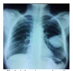
Fig 1: A thoracic x-ray showed a limited left hilo-axillary with a homogenously dense opacity.

rib. A thoracic x-ray showed a limited left hilo-axillary with a homogenously dense opacity[fig1]. The thoracic CT scan showed the presence of a thoracic parietal mass of osteolytic tissue density centered on the anterior arch of the 4th left rib[fig2,3]; without contrast agent, the surgical exploration through a thoracotomy revealed a thoracic parietal tumoral process at the expense of the anterior arch of the 4th limb pushing the corresponding lung inwards. Surgical excision allowed ablation of the whole tumor in monobloc towards a healthy zone[fig4,5]. The anatomopathological study of the operative specimen showed a morphological and histopathological aspect compatible with a costal tumor with giant cells[fig6]. The postoperative recovery was marked by a good clinical and radiological improvement[fig7]. The last check up after the surgery revealed that the patient was still asymptomatic. Good clinical, biological and radiological improvement was noted with a decline of 8 months.