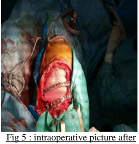
reconstruction of the parietal defect.