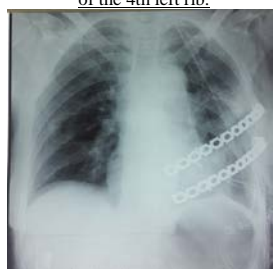
Fig 7: Postoperative thoracic x ray